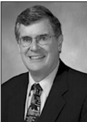
Senator Peter Burling